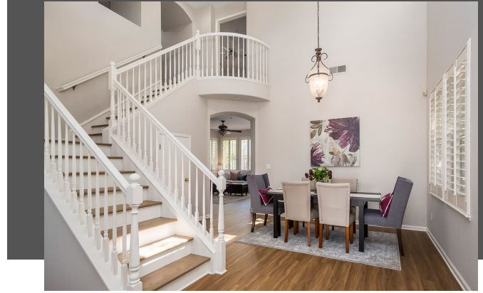
Luxury vinyl plank was installed successfully over old and stained engineered wood in Hamilton

How's your flooring? Up-to-date floor coverings are a great investment and go a long way toward adding value to your home.