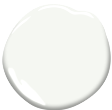
True white BM Chantilly Lace OC-65