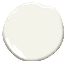
Off white BM Simply White OC-117