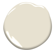
Complex cream BM Feather Down OC-6