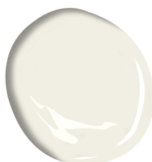
Off white BM White Dove OC-17