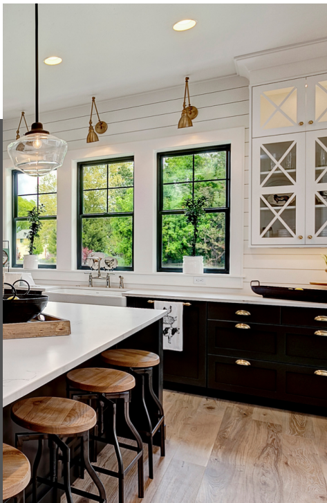
Kitchen in the black and white trend

The right paint choice for many homes is a pale neutral, a 'barely there' gray or beige that gives you a fresher and updated look but isn't too stark.