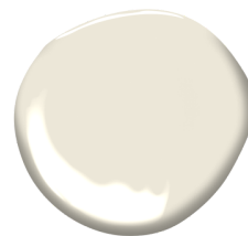
Cream BM White Down OC-131