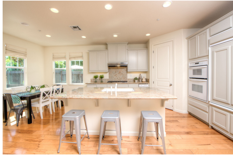
Cabinets painted Benjamin Moore Revere Pewter to relate to the green-gray in the granite counter tops. The result is a light "putty" color

NOTE: There is no one-size-fits-all color for cabinets or walls! The fixed elements in your home, plus any large upholstered furniture, will dictate the right color choice. Think of this advice as a starting point.